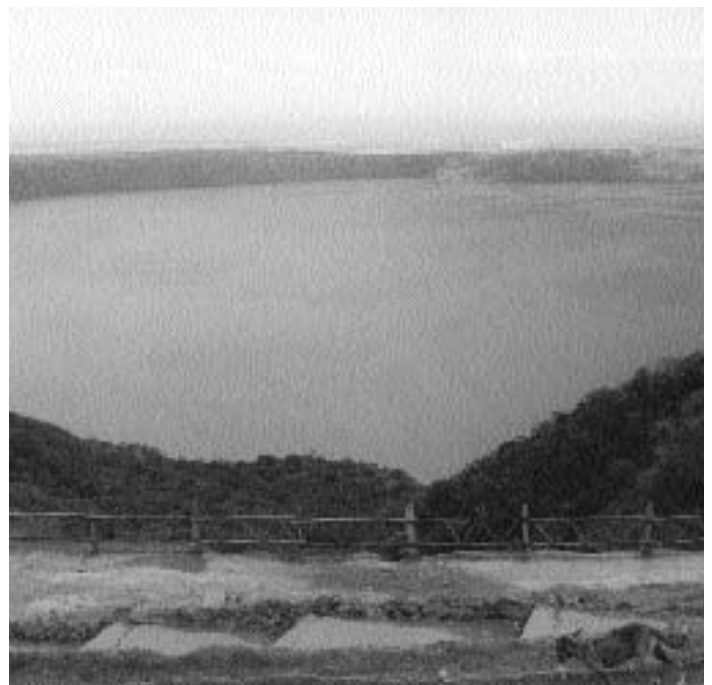
Laguna de Apoyo, Catarina